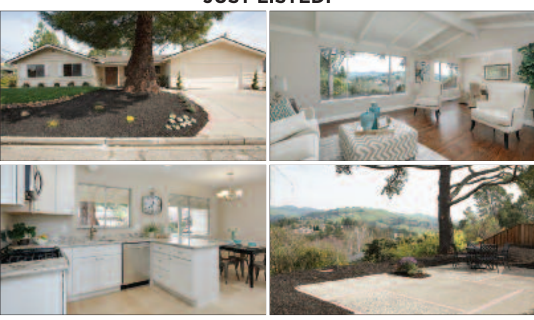
5 Fieldbrook Place, Moraga | Offered at $1,249,000 4 Bedrooms, 3 Bathroom, 2045± sq. ft.